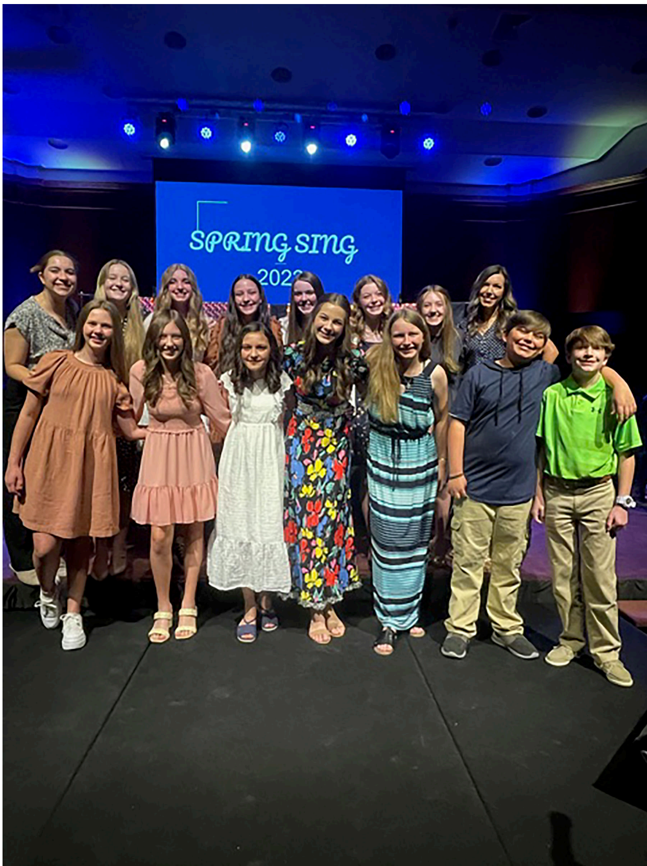
The Spirit Squad would like to thank all participants who came out for the mini cheer camp! They showcased their skills during the spring sports pep rally.