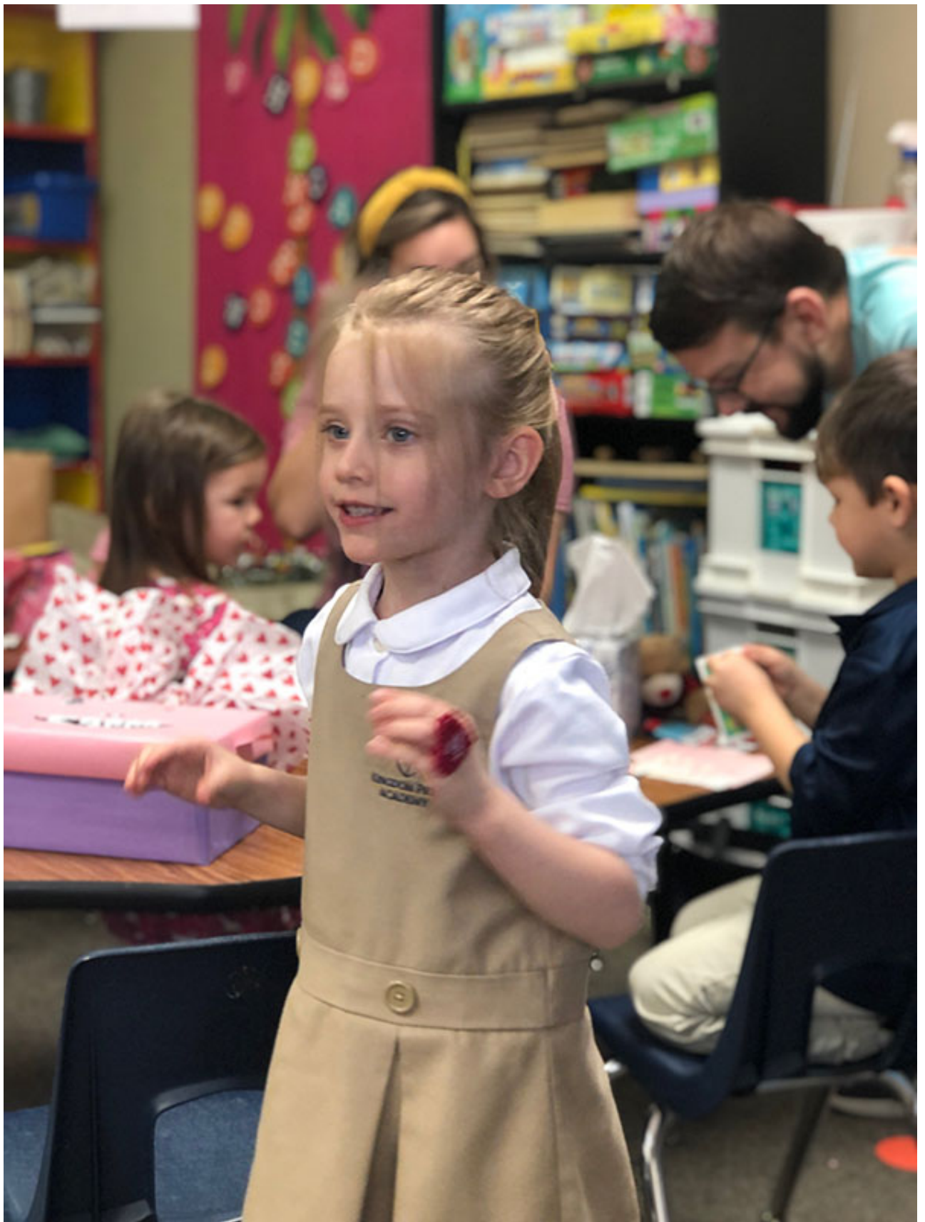
Grammar school Enrichment celebrated Winter Olympics in each of their classes on Friday, Feb 11th. Olympic bingo, penguin races, biathlon races, art, winter games and food tasting from China are just some of the activities that students participated in.