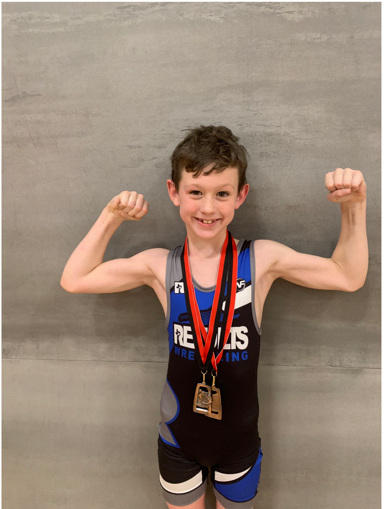
Grammar school students celebrated Valentine's Day during their parties on Monday. Here are a few pictures from Pre-K's valentine's party: