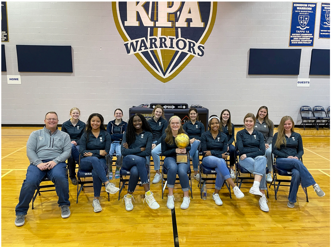
Here are a few pictures from the School of Rhetoric Super Bowl party.