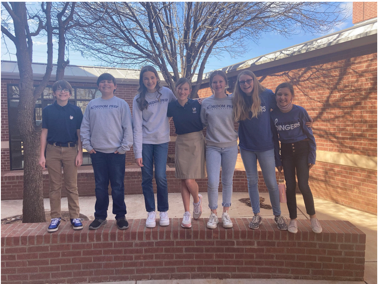
School of Rhetoric students spent an afternoon at Lubbock Impact helping them in their clothing room and working on redoing one of their activity rooms. Thank you for your hard work!