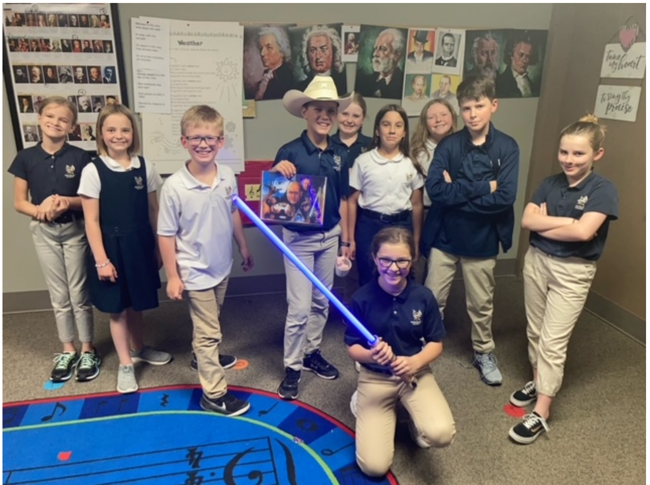
Celebrating my 5th grade students! These Musicians have accomplished so much!!