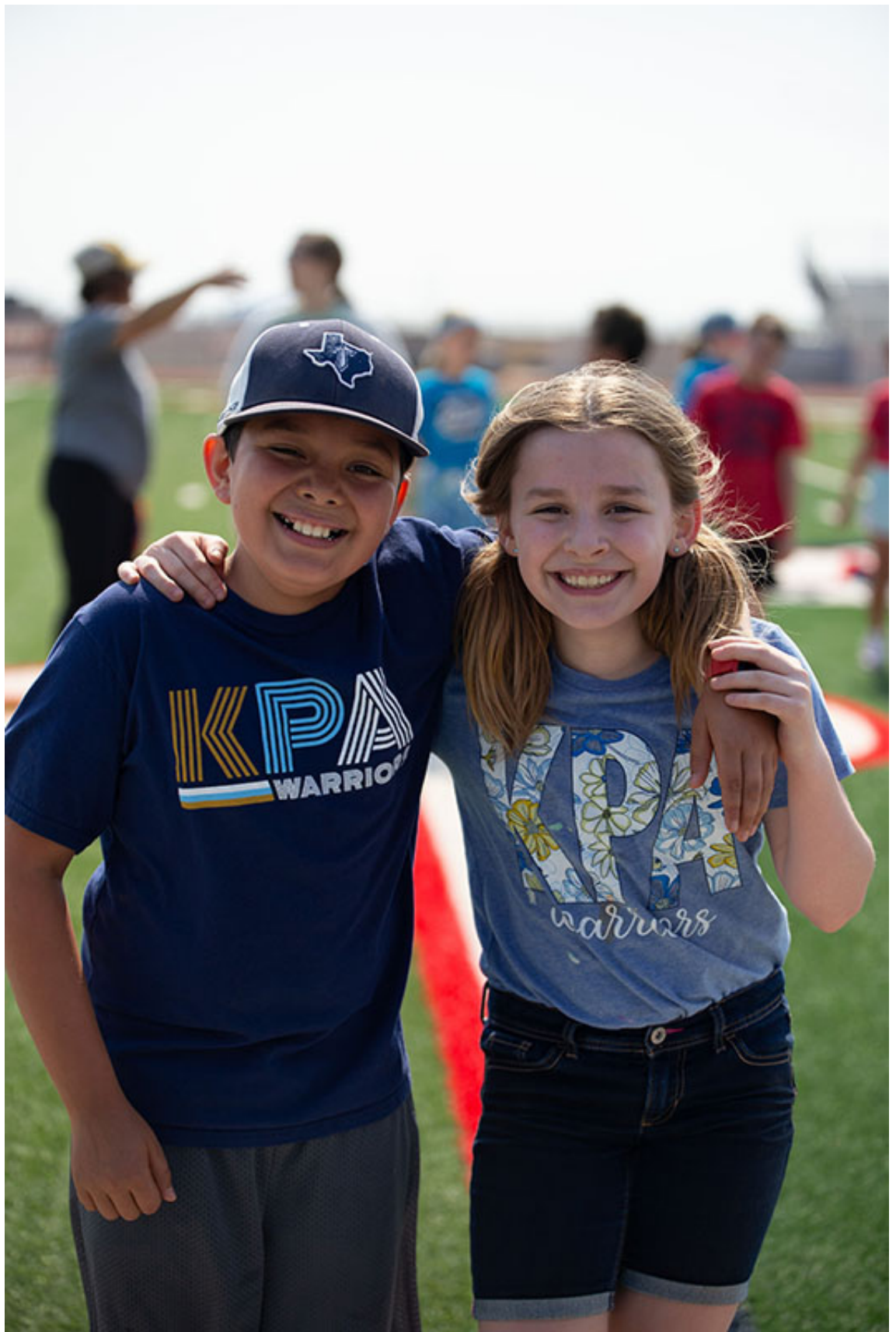
Kingdom Singers celebrations! I am so proud of these singers! Using their gifts to Glorify His Name!